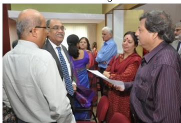
Networking in Full Swing