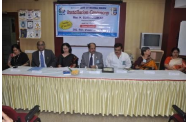
Ready for Installation

Meeting ended with serving delicious snacks and fellowship. Over all it was well organized event.