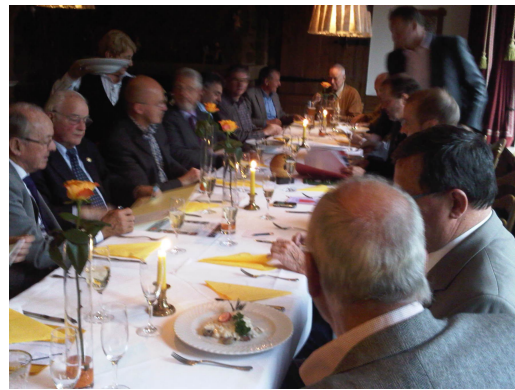
Fellowship and Networking