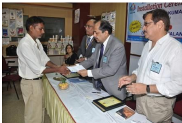
RCMM extends Helping Hand