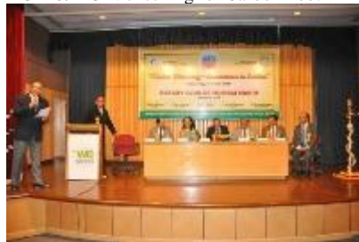
Commencing the Event