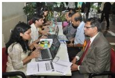
DG E & DG N checking for Carbon Foot Print