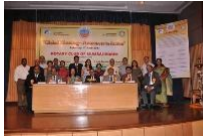
All Presidents with DG, DGE, DGN Who Signed the Charter