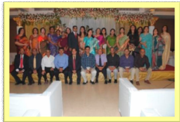
RCMM Members with Newly Weds

Visit our Web Site at http://www.rotarymahim.com/