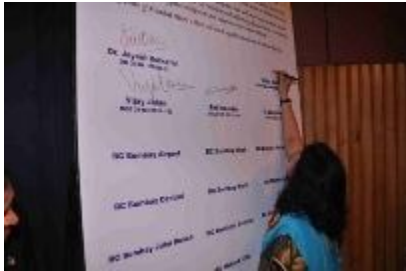
PR. Vidya Signing the Charter