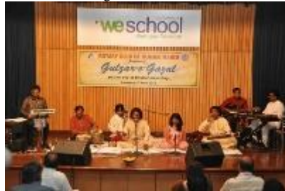
Group of Singers and Musicians