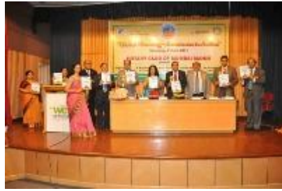
Release of Special Issue of Mahim Waves