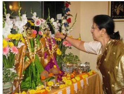
Pres. Vidya offering Kumkum

house. This symbolizes the prosperity and protection of plants and crops. Many people believe in this.