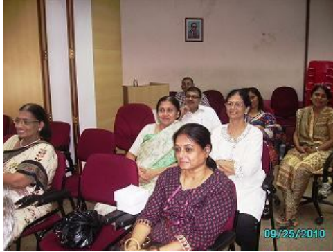
Mahim Club Members at DAUD session

Getting good speakers on interesting and relevant topics goes a long way in enticing people to attend meetings.