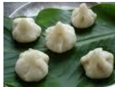
Special Prasad - Modaks