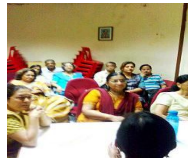
Rotarians engrossed in the Lecture