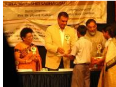
The anchor of the event being appreciated by the guests