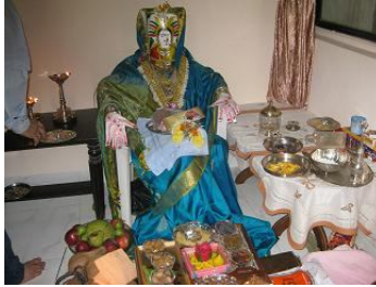
One more form of Gauri