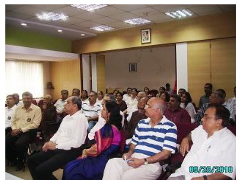
Engrossed Rotarians in DAUD session