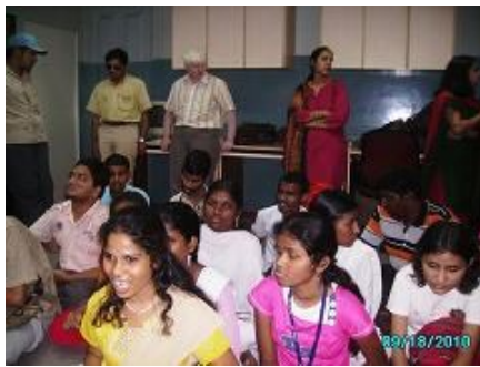
Girl Student singing for all