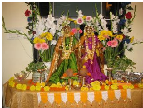
Gauri – at Rtn. Sandhya's house

It is advocated to perform pooja of Mahalaxmi along with 'Gauri', thus there are always two images, which are simultaneously worshipped.